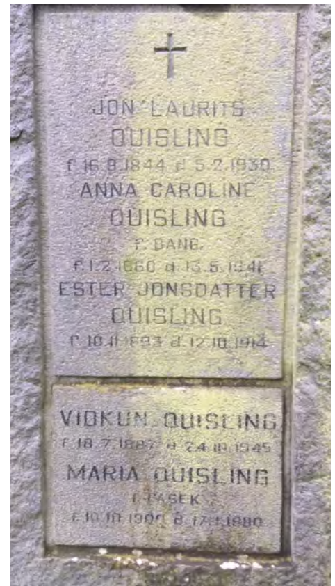
Vidkun Quisling is buried in the same grave as his parents.

A side note on Quisling! The Military History Channel had several programs on The Nazi Collaborators in different countries. It mentioned that he was on a relief mission to the Soviet Union during the 1920's famine caused partially by drought, Bolshevik incompetence and mismanagement! He became very Anti-communist after seeing the results of a Communist government! Not an excuse, but interesting!