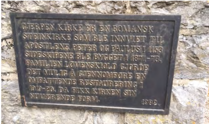
The sign above is located at the Gjerpen Church as reads: Gjerpen Church is a stone church from the Romantic period which was dedicated to the apostles Peter and Paul in 1153. The naves were built in 1871-73. The family Løvenskiold made it possible to accomplish an extensive restoration in 1919-20. At that time the church got its present form.

The Tur til Telemark in 2016 included a stop in Skien. It is one of Norway's oldest cities, with an urban history dating back to the Middle Ages, the Administrative Center for Telemark and was part of the old Grenland area of Telemark.