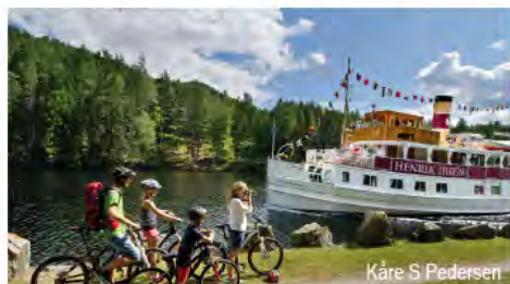
Kåre S Pedersen

Following the cruise individuals may choose one of the following options instead of the vineyard and Kviteseid: Kayak on the canal (NOK 250) or Bike along the canal (NOK 200). Pre-registration requested. Please indicate interest on application form. Cost payable in Norway.