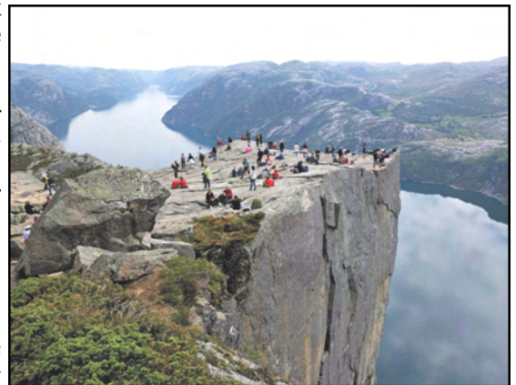
Prekestolen [The "Pulpit Rock"] near Stavanger, one of the sites to be viewed during the 2012 Telemark /Norway Tour.