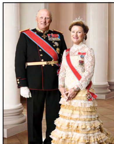
King Harald V and Queen Sonja