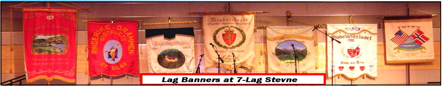
Lag Banners at 7-Lag Stevne