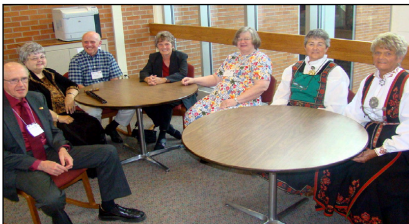
Telelaget members "social networking" at the 2010 7-Lag Stevne held at Winona State University