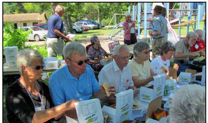
Members attend picnic at Winona's Prairie Island Park following the 7-Lag Stevne