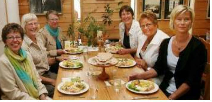
The café at the Ski Museum in Morgedal offers warm meals with traditional food all year round. In Eidsborg you find a summer open café.